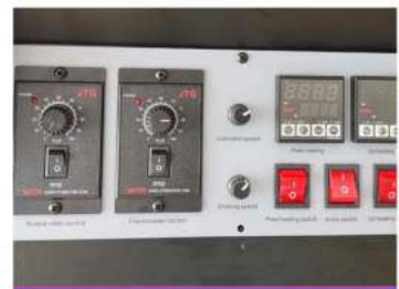
Shake powder machine control panel