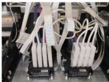
With i3200 print head